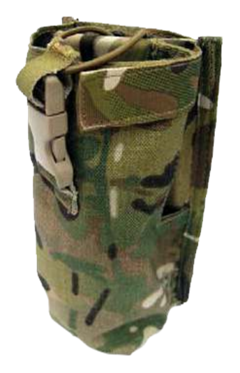
Pouch shown in MultiCam